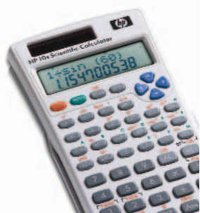
Dual Power: Solar and battery